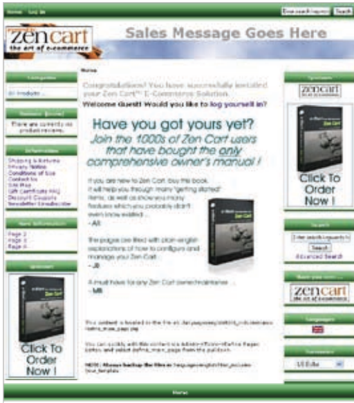
UNCUSTOMIZED WEBSTORE (ZEN CART)