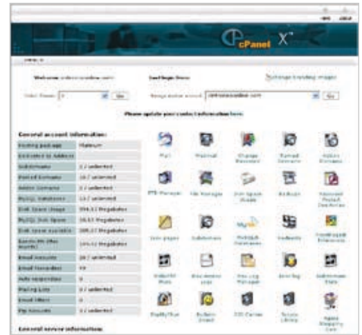
HOSTING CONTROL PANEL (CPANEL)

We can provide you, our reseller, with your webstore and associated hosting; resellers with sufficient sales volume will receive this free of charge. Your webstore comes with 240MB of disk space, 2GB monthly transfer, unlimited* email/webmail accounts and email forwarding. We can set up email accounts for you or you can set them up via the hosting control panel shown at right.