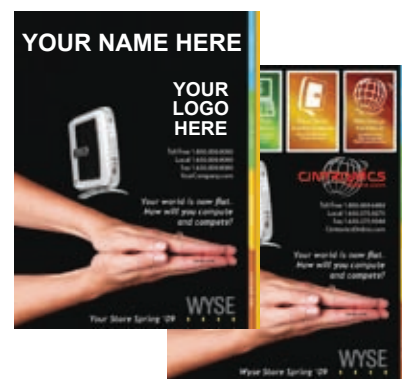
CUSTOMIZED MARKETING MATERIALS

What would you say about a distributor that could offer you custom professional marketing materials bearing your logo and contact information? How about a custom webstore? We offer these advantages AND the ability to pay for them using earned co-op dollars. That's right! Use your custom marketing materials and professional website to generate leads. Arrive at your sales appointments with glossy marketing materials and spec sheets that are designed specifically for your company. How about an online demo on your website? At the same time you're taking orders at your webstore! Now THAT is the power to compete!